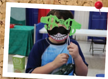
Career Connections: LSCU visited with more than 4,400 high school students about credit union careers and financial education.